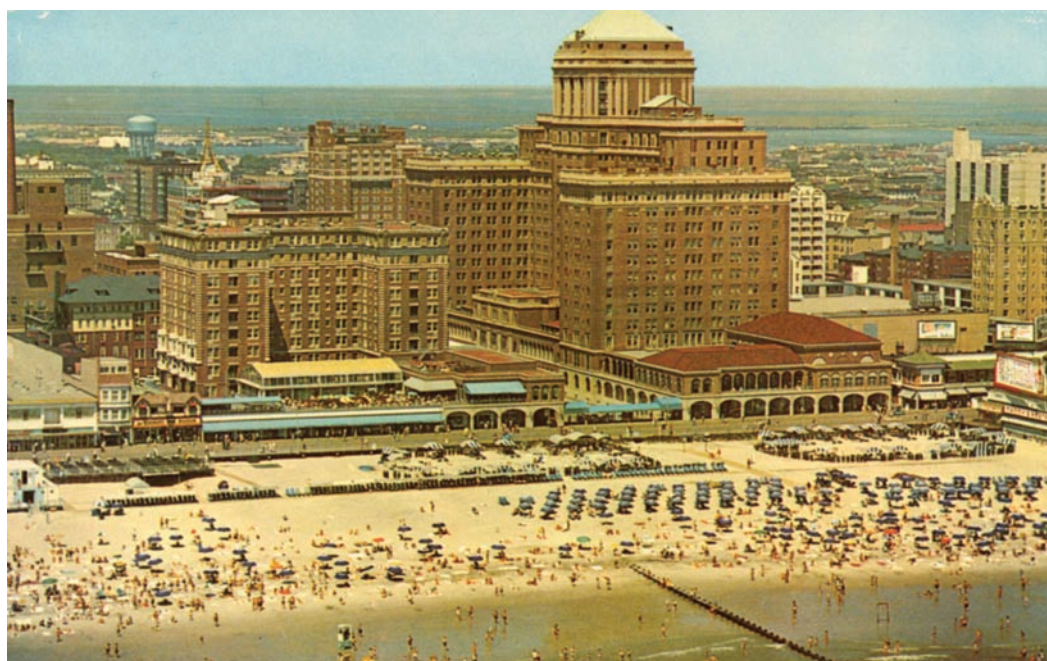
Figure 2 Haddon Hall — the historic Atlantic City, New Jersey, hotel that served as the official meeting place for the ASCI annual meetings.

It is easy to reminisce about Atlantic City, but this would have little meaning to members who had never attended an ASCI meeting there. There is a spirit that was established in Atlantic City over the decades during which the meetings were held there that still prevails regardless of the physical location of the meetings. The gatherings in the lobby of Haddon Hall, the stately hotel where the major scientific sessions were held (Figure 2); the steamed crabs at Captain Starn’s, the legendary restaurant located nearby on the Boardwalk, where there was never an empty seat; the martinis at Zaberer’s, the watering hole a few miles outside of Atlantic City; and the walks along the Boardwalk in the early morning and at sunset – all of these provided a milieu of warmth, affection for one’s peers and idols, and a feeling of wanting to belong and of gradually coming to belong. My day was made if walking on the